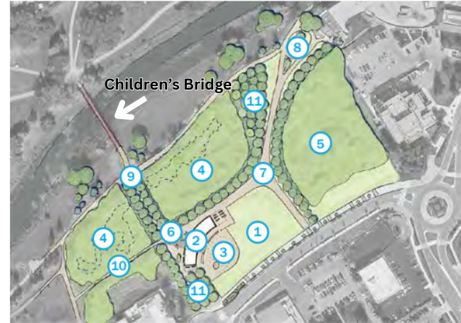
Key Map - Concept Site Plan

In December of 2023, this original plan was scrapped, and city council abruptly chose the "high development" option out of 3 concepts presented to them. This plan then prompted the first reading of the $20.8 million borrowing bylaw to fund this version of a redesigned Millennium Park, spurring the petition of April 2024.